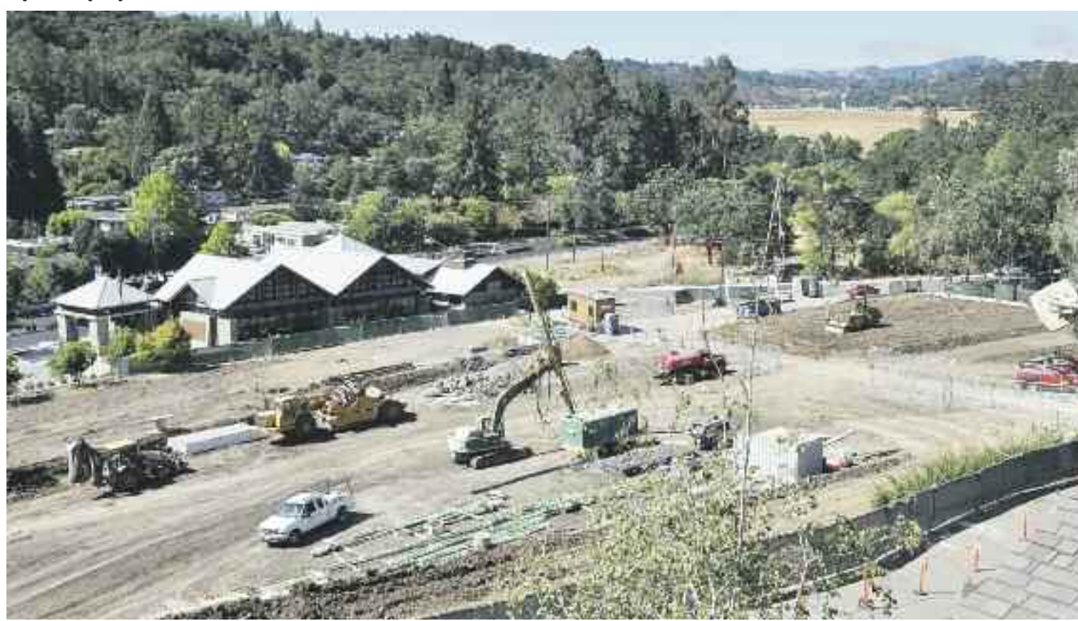
View looking down on the Woodbury construction site.

re construction trucks the new Lcivic mascot for Lafayette? It's possible given the amount of remodels, grading, electrical, plumbing and mechanical work that's been happening within the city limits, according to the Contra Costa County Building Inspection Division. Every county keeps track of building activity for tax purposes.